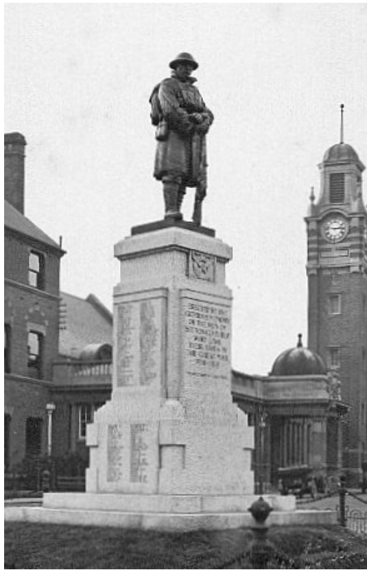
The memorial is located in front of the town hall/council house. The scanned image comes from a 1920s postcard and the memorial was unveiled on November 1st (All Saints Day) 1922. Since this photo was taken, the chain links around the base have been removed, and the names of the WW II dead have been added.