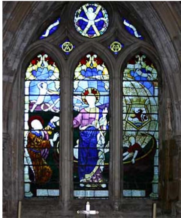
WINDOW IN EXETER CATHEDRAL DEDICATED TO THE EXETER CREWMEN.